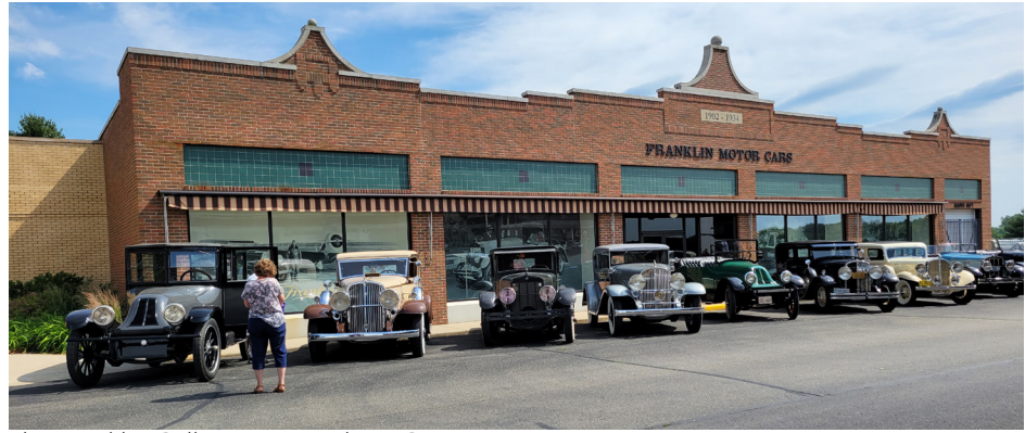
The Franklin Collection at Hickory Corners