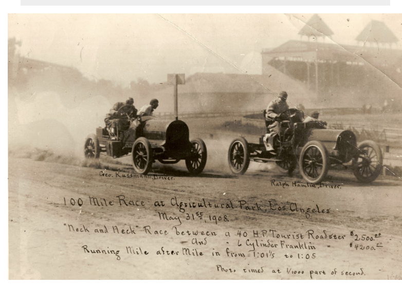
Reproduced in Driving Force.