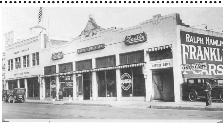
Ralph Hamlin's Dealership, located at 1040 South Ferry, 1914. From ACN #162, page 26